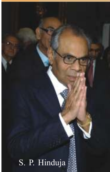
S. P. Hinduja